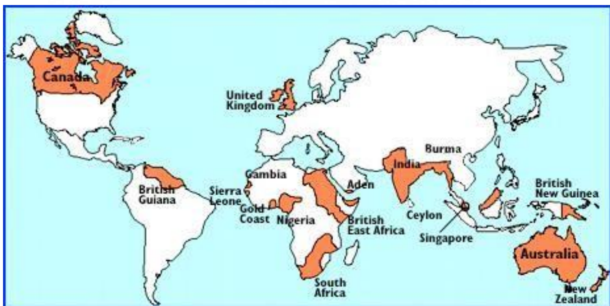
The land area which was under British Empire in 1900

Before English was considered to be the universal language, French was the universal one. The first and foremost reason behind it is the wide expanse of British kingdom around the world in twentieth century.